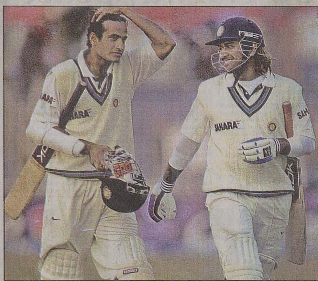
India's Mahendra Dhoni (R) and Irfan Pathan leave the field unbeaten at the end of third day's play of the second Test against Pakistan at the Iqbal Stadium in Faisalabad on Monday.