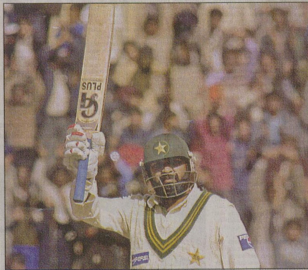
Pakistan captain Inzamamul Haq raises his bat after scoring a century on the second day of the second Test against India at the Iqbal Cricket Stadium in Faisalabad on Sunday.