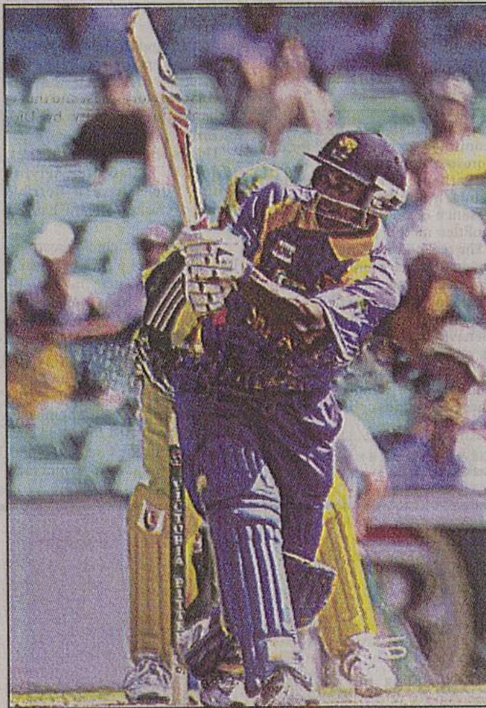
BACK WITH A BANG: Sri Lanka opener Sanath Jayasuriya hits one for the maximum on way to a scintillating century against Australia in the VB Series match at the SCG on Sunday.