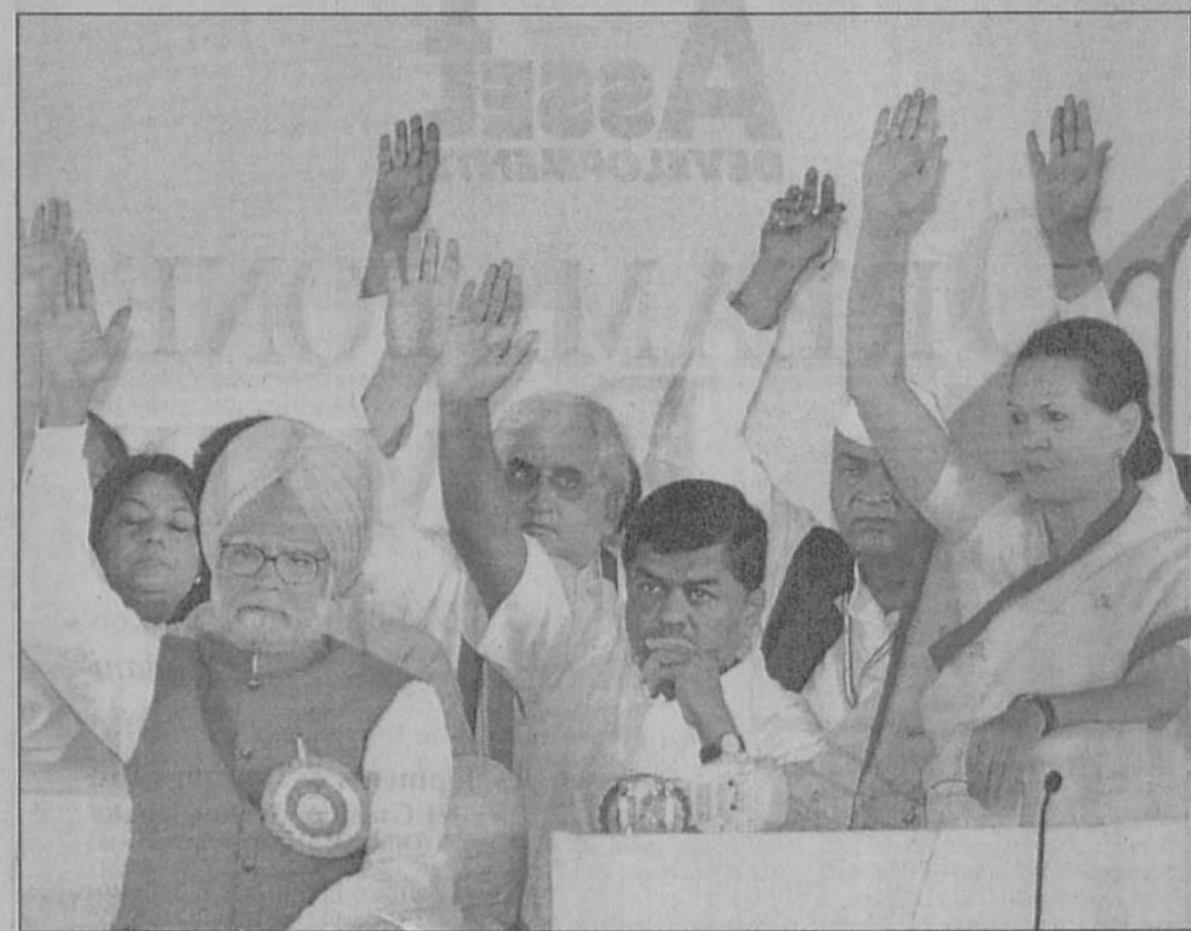
Indian Prime Minister Manmohan Singh (L) and Congress Party chief Sonia Gandhi (R) raise their hands as they take part in the 82nd Indian National Congress Party Plenary session at the Gachibowli Stadium in Hyderabad yesterday.