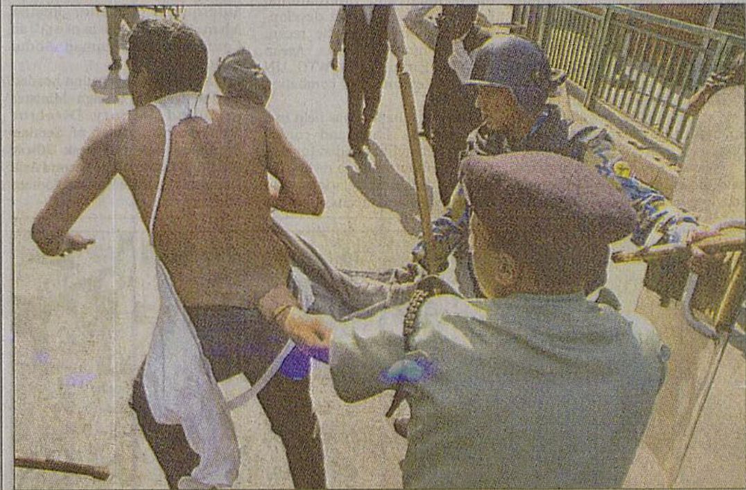
An Awami League activist struggles hard to free himself from the clutch of policemen at Zero Point in the capital during hartal hours yesterday.