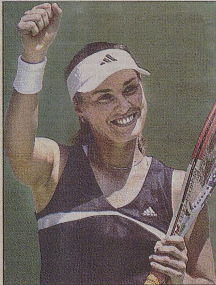
Switzerland's Martina Hingis is elated after winning her third round match of the Australian Open in Melbourne on Saturday.