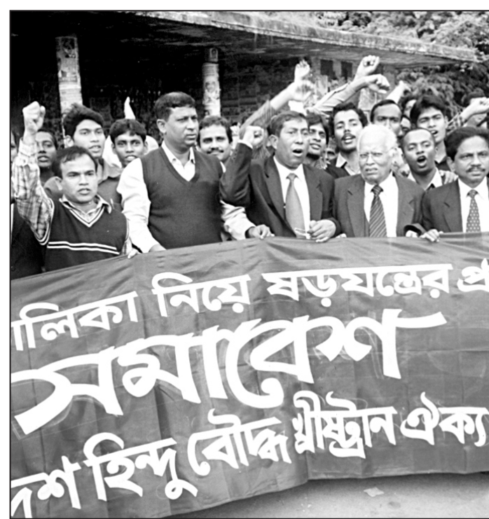
Bangladesh Hindu Boudhha Christian Oikya Parishad stages a demonstration at Mukhtangan in the city yesterday protesting the 'conspiracy' over voter listing.