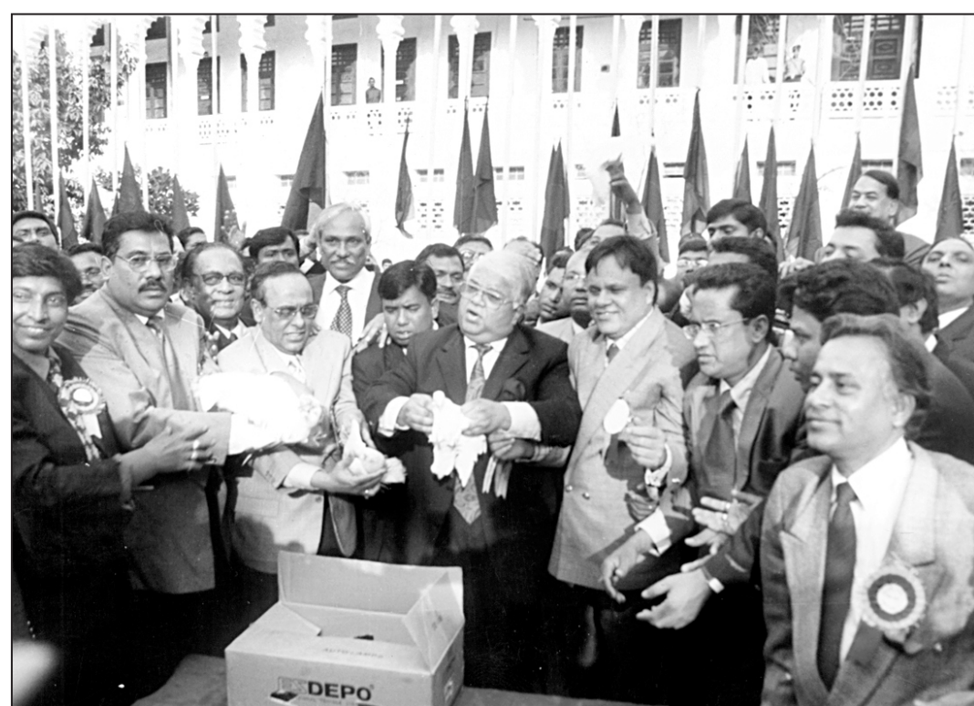
Communications Minister Nazmul Huda inaugurates the national convention of Jatiyatabadi Ainjibi Forum on the Supreme Court premises in the city yesterday by releasing pigeons.

The police arrested Gomes in the afternoon after a case was filed with the Kalapara Police Station.