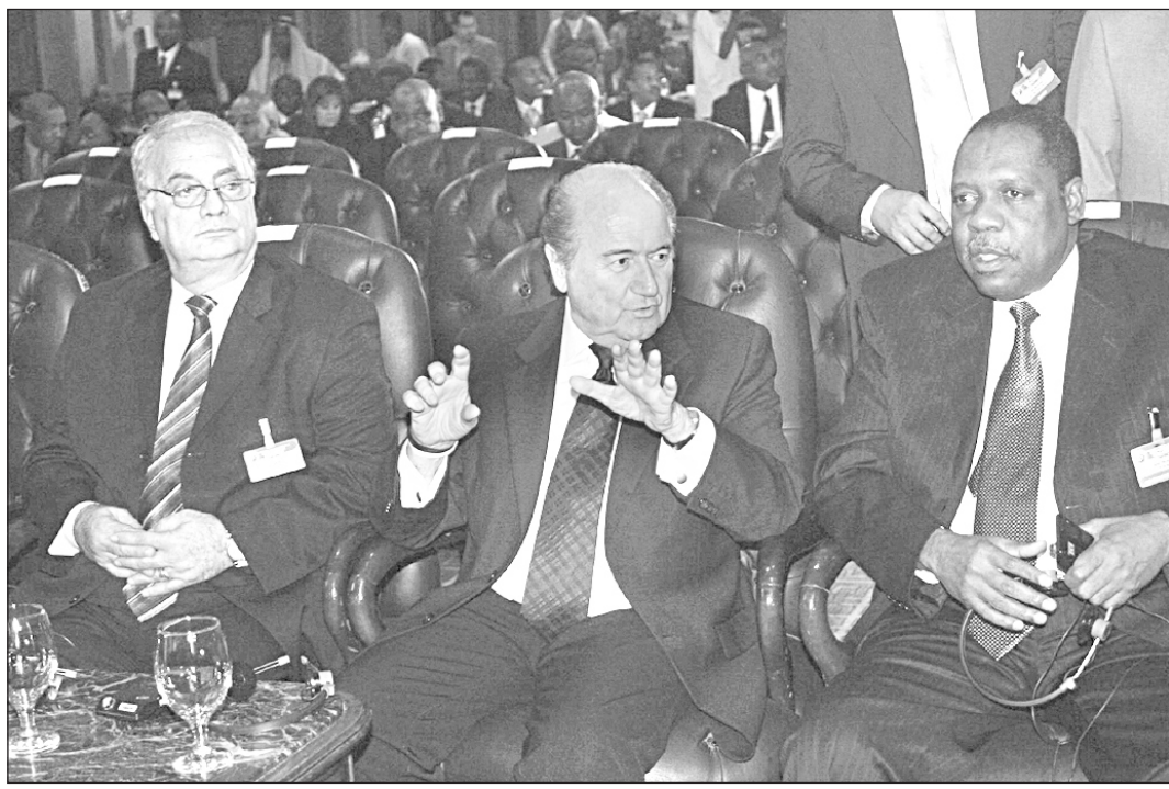
FIFA president Sepp Blatter (C) speaking at the general assembly of the Confederation of African Football in Cairo on Tuesday.