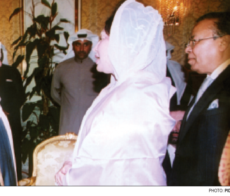
Prime Minister Khaleda Zia talks to newly appointed Kuwaiti Premier Sheikh Sabah Al-Ahmed Al-Zaber Al-Sabah at the Bayan Palace in Kuwait City on Monday.