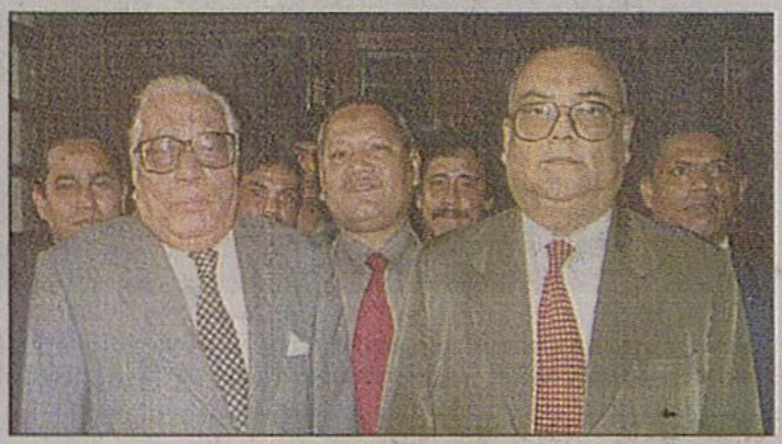
PHOTO: STAR Newly appointed election commissioners Justice Mahfuzur Rahman, left, and SM Zakaria walk out of the High Court after taking oath yesterday.

STAFF CORRESPONDENT In the wake of an impasse over preparing a fresh voter list, the government in a hasty move yesterday appointed two more election commissioners apparently to win the chief election commissioner (CEC) the majority in the commission.