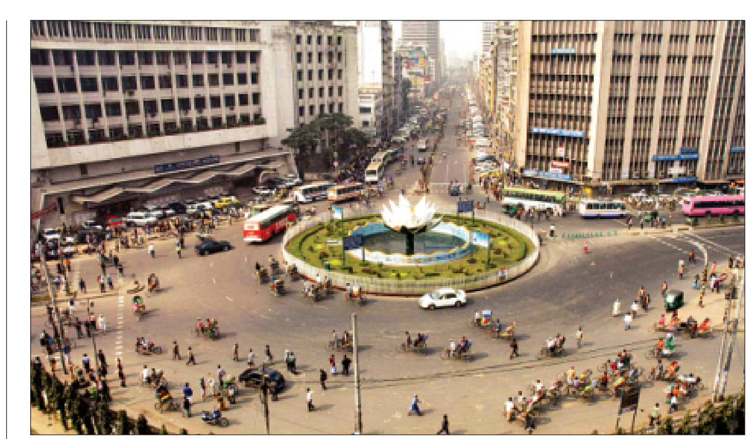
EID HANGOVER PERSISTS: The usually busy downtown Motijheel in the city looks almost deserted yesterday after consecutive five days of Eid vacation and weekend.