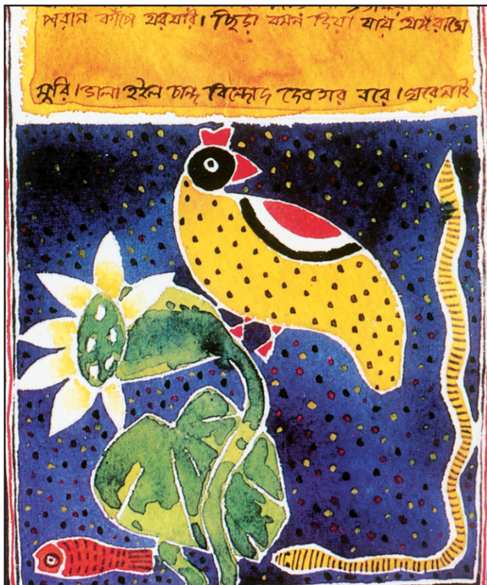
The artist (top), an artwork by Shakoor

The shapes are simplified in their stylised presentation. The colours are primary and direct so that they appear both modern and traditional as post-modernism often features the primeval colours. Shakoor also