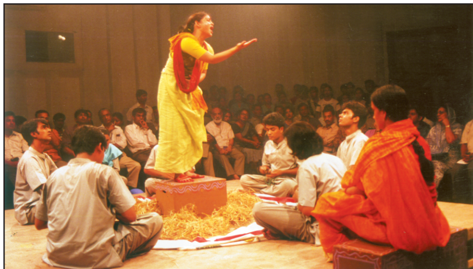
A narrator (C) reciting the prologue in the play