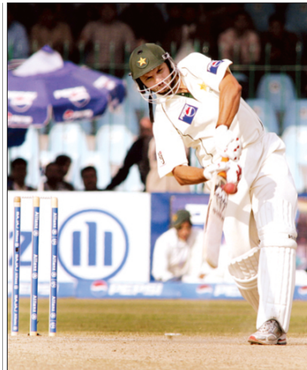
IN MARAUDING MOOD: Pakistan's Shahid Afridi lofts one over long-on on way to scoring an 80-ball 103 on the second day of the first Test against India in Lahore on Saturday.