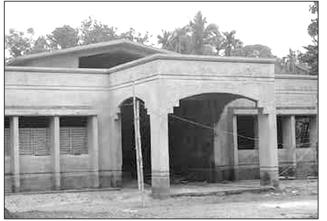
Construction of the Kurigram Diabetic Hospital is nearing completion, much to the expectation of patients in the area.

But some sources in the area said the two were involved with Kushtia JMB leader Shamsul Hoq. They had fled homes soon after countrywide drive against Islamist militants.