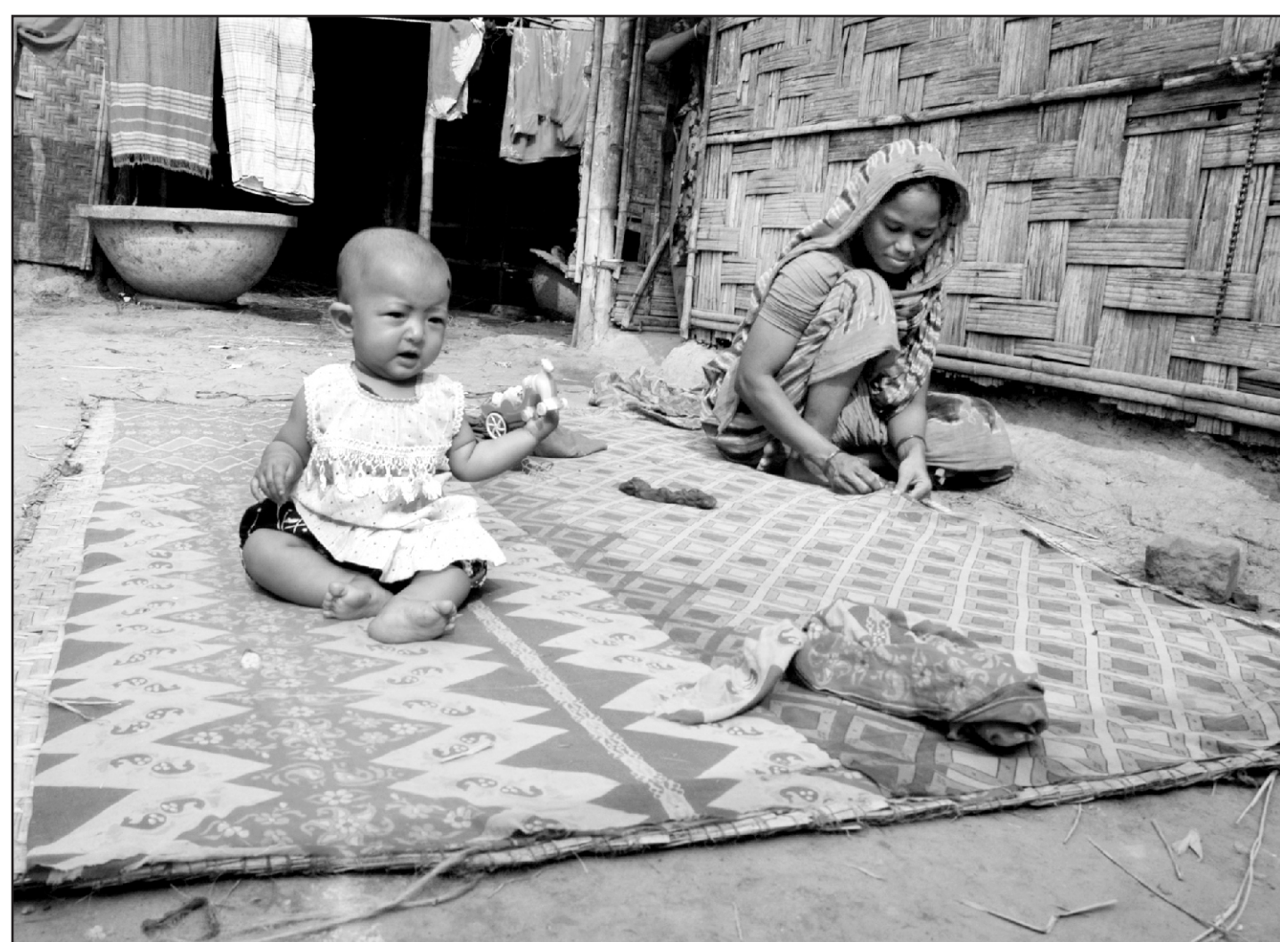
A woman makes a quilt in the yard of her house at Savar yesterday as a spell of shivering cold sweeps the country.

The Rapid Action Battalion (Rab) rushed to the spot, recovered four seriously injured, including a woman and sent them to Manikganj Sadar Hospital in critical condition.