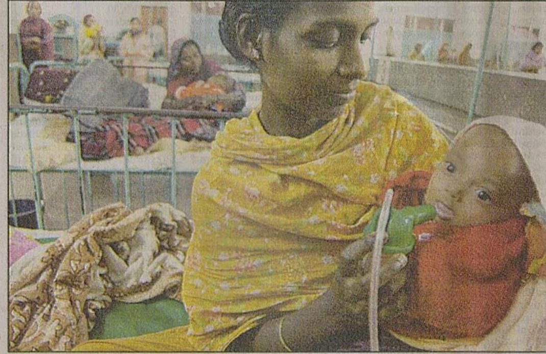
A mother nebulises her pneumonia-stricken child at Dhaka Shishu Hospital yesterday. A rush of sick children has overcrowded the hospital in the wake of ongoing cold wave.