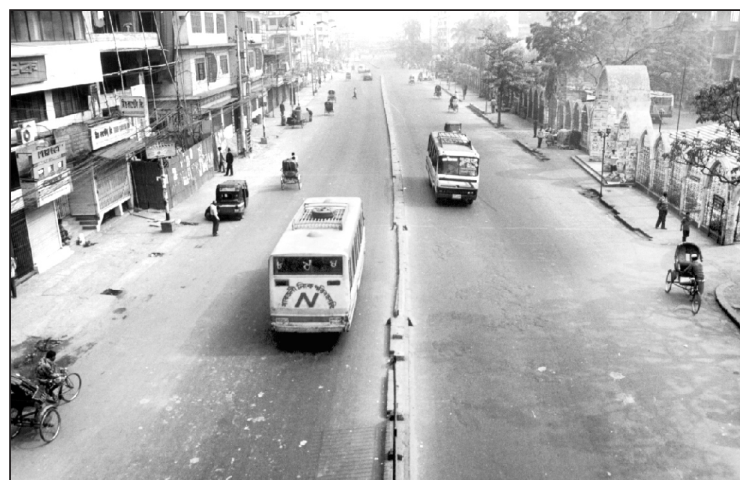
Paltan area, one of the busiest areas in the city, wore a deserted look yesterday as most city dwellers left for their village homes to celebrate Eid.