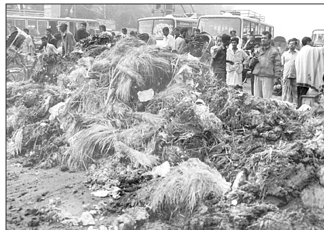
Piles of animal garbage still lie on the street at Naya Bazar in the old part of the city yesterday, emanating stink and causing hazards to environment.