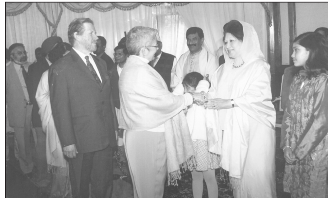
Prime Minister Khaleda Zia exchanges Eid greetings with diplomats at a reception at the Pradhanmantri Bhaban in the city on the Eid day.

Important city corners and public buildings were illuminated and improved diet was served in the hospitals, jails, orphanages, and also in youth and juveniles centres run by the social welfare department.