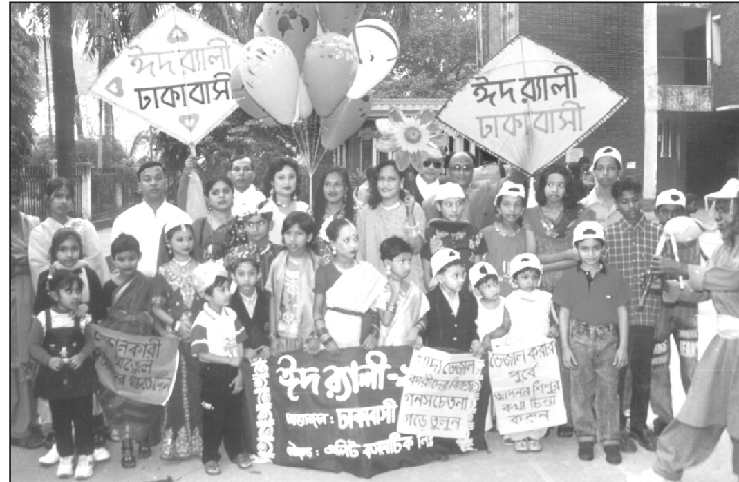
Dhakabashi took out a colourful procession in the city yesterday to celebrate Eid.