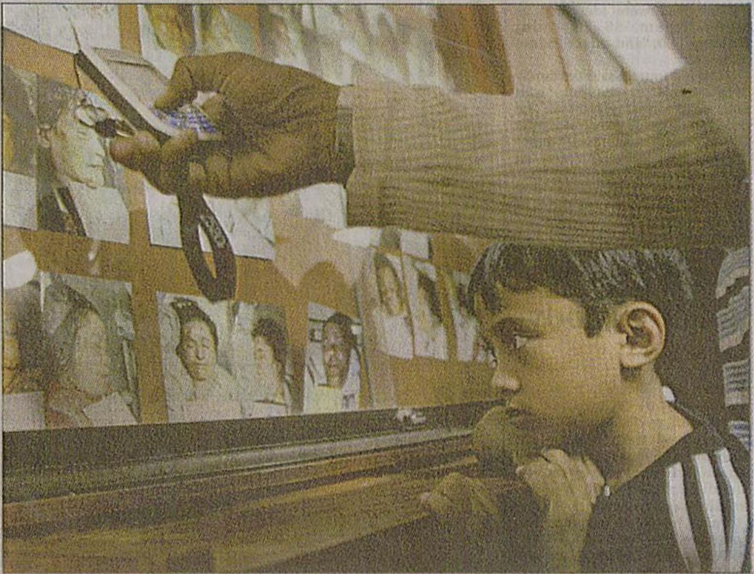
An Indonesian boy looks at the picture of his dead mother (second set from left) at Al-Muaysem morgue in Mina yesterday, while another pilgrim uses his mobile phone to take pictures of unidentified pilgrims who died in a stampede during stoning of pillars in Mina on Thursday.