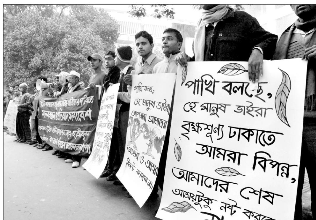
Students of Buet and DU and Bangladesh Paribesh Andolon form a human chain at the main gate of Buet in the city yesterday demanding cancellation of a decision to fell trees.

On the occasion, Prof Nurul Islam Foundation will arrange milad mahfil and distribute food on January 12 at his village in Patuakhali.