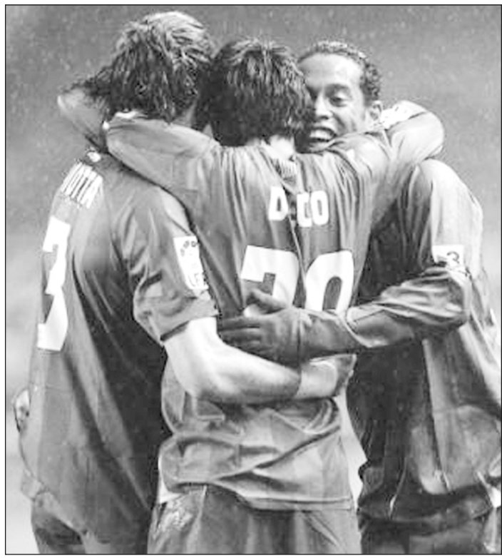
Barcelona midfielder Deco (C) is congratulated by teammate Ronaldinho (R) and Thiago Motta after he scored against Espanyol during their Primera Liga clash at the Olympic Stadium in Saturday.

Champions League contenders Deportivo La Coruna bagged a useful 2-1 win at Athletic Bilbao to move joint third with Valencia, who travel to Atletico Madrid on Sunday.