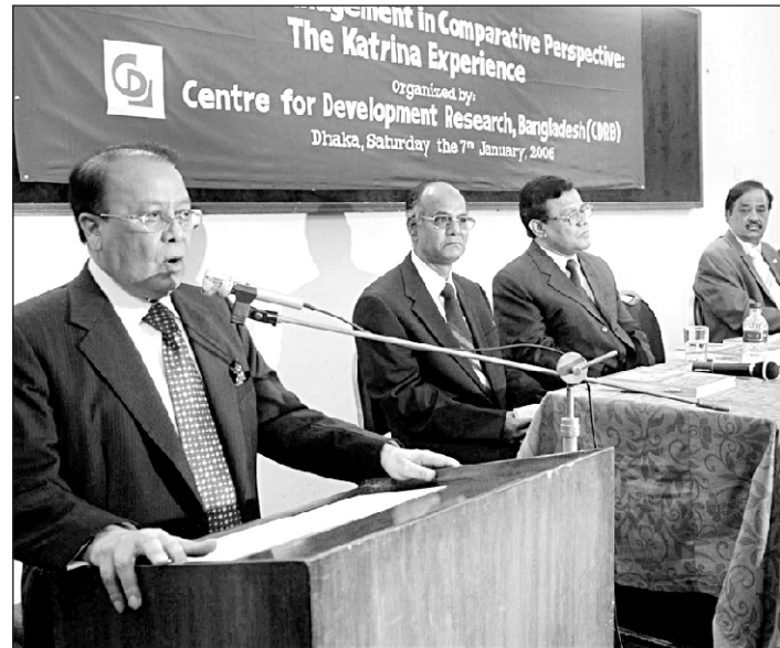
Foreign Minister M Morshed Khan speaks at a seminar on 'Disaster Management in Comparative Perspective: The Katrina Experience' at the WVA auditorium in the city yesterday.

"We must learn from each other's experience and make concerted efforts to deal with post-disaster situation," said Foreign Minister M Morshed