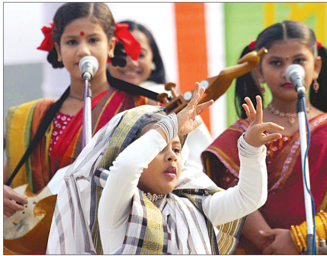
Child artistes perform at the Poush Mela in Dhanmondi's Rabindra Sarobar yesterday.