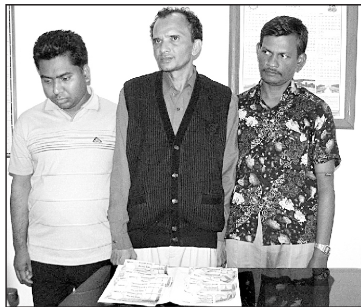
Detective Branch (DB) of police recovered fake notes of Tk 500 and arrested three persons after conducting raids from different parts of Chittagong city yesterday.