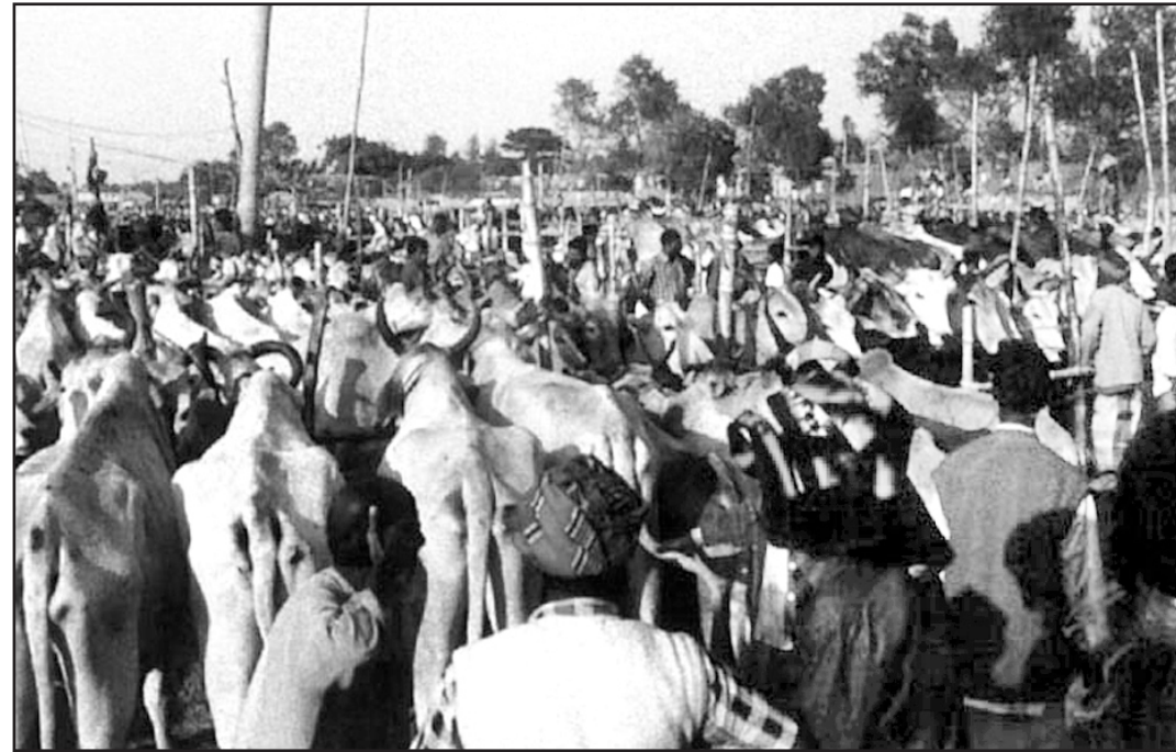
A cattle market at Gobindasi in Tangail. Traders who came here from far flung areas of various districts have complained of extortion and inadequate security measures taken by the authorities concerned at various points on the way.

'Price of sacrificial animals marked rise this year due to reduction in import of animals from India,' he added.