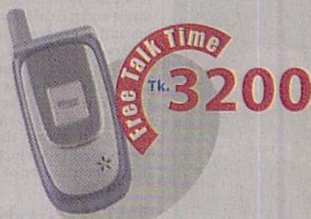
UTStarcom C1160 TK. 3499*