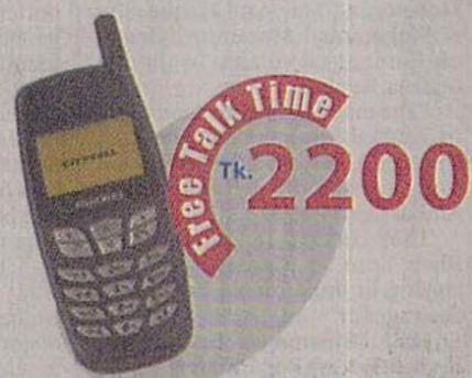
Huawei C218 TK. 2499*