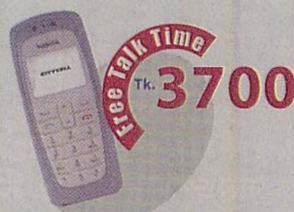
Nokia 2112 TK. 3999*

* Call FREE to any CityCell phone from Aalap Super Plus during 1pm to 3pm & 12am to 6am