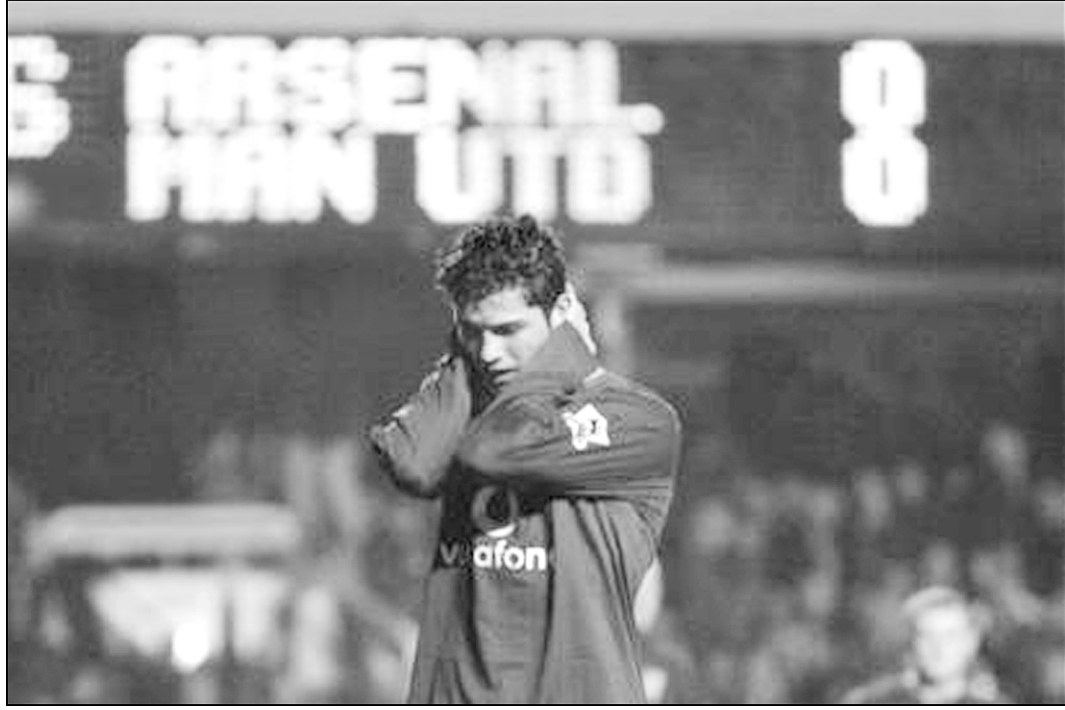
Manchester United forward Cristiano Ronaldo reacts to his missed chance against Arsenal during their Premiership encounter at Highbury on Tuesday.