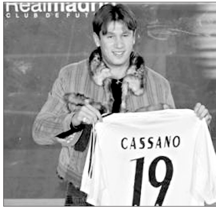
Italian striker Antonio Cassano holds his Real Madrid shirt at the Bernabeu on Wednesday. Cassano is only the second Italian player ever to play for the famed Spanish side after right-back Christian Panucci.

"We want to be the nearest team to Chelsea, just in case they collapse. You never know what might happen."