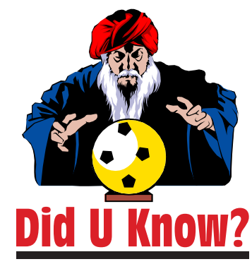
The five Olympic rings represent the five major regions of the world Africa, the Americas, Asia, Europe and Oceania and every national flag in the world includes one of the five colours, which are (from left to right) blue, vellow, black, green, and red.

The winners will receive Tk 5 lakh as prize money and the runners-up will be richer by Tk 3 lakh. The player of the tournament will pocket Tk 50,000 and a motorbike while the organisers have yesterday announced Tk 25,000 for the top scorer.