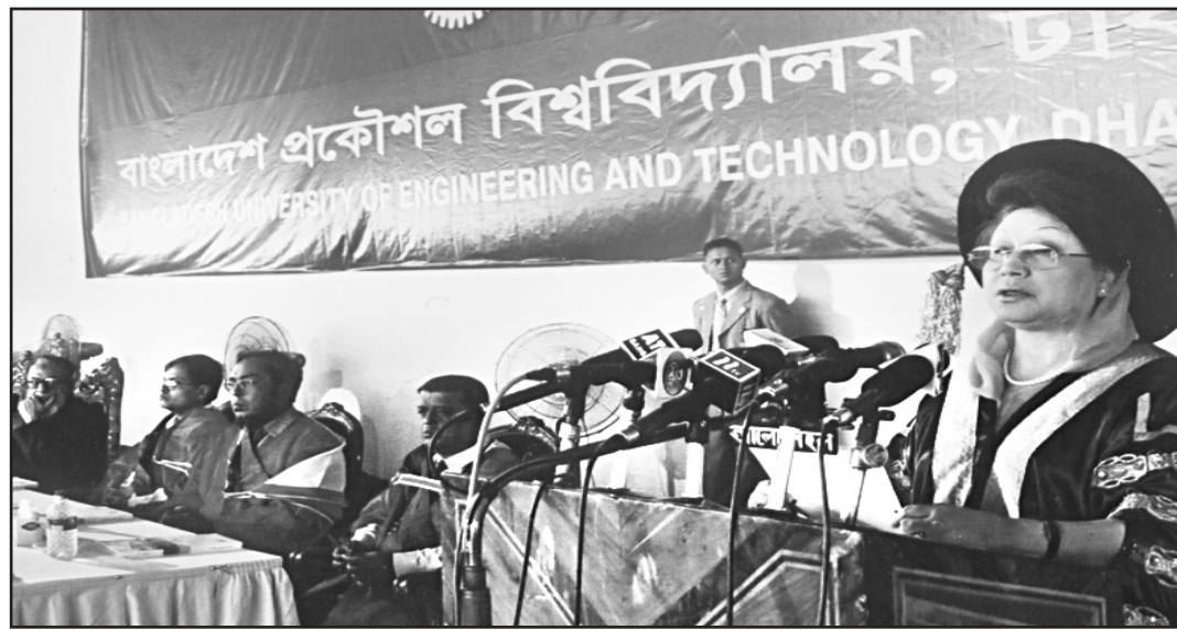
Prime Minister Khaleda Zia addresses the 9th convocation of Bangladesh University of Engineering and Technology (Buet) on its campus in the city yesterday.

She also took part in the ceremonial convocation procession.