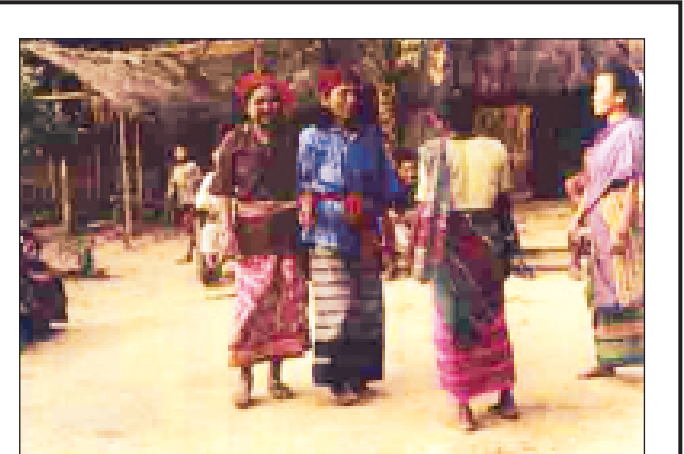
'Wanna', a three-day harvest festival of the Garo people, began yesterday at Madhupur in Tangail with traditional fervour.