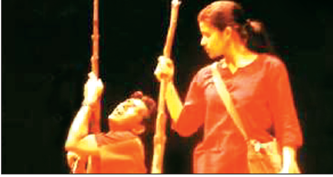
A scene from the play Che'r Cycle

The silver jubilee celebration of Dhaka Padatik is another major event in 2005. The eight-day festival, at the National Theatre Stage, also showcased theatre produc-tions from local and Kolkata