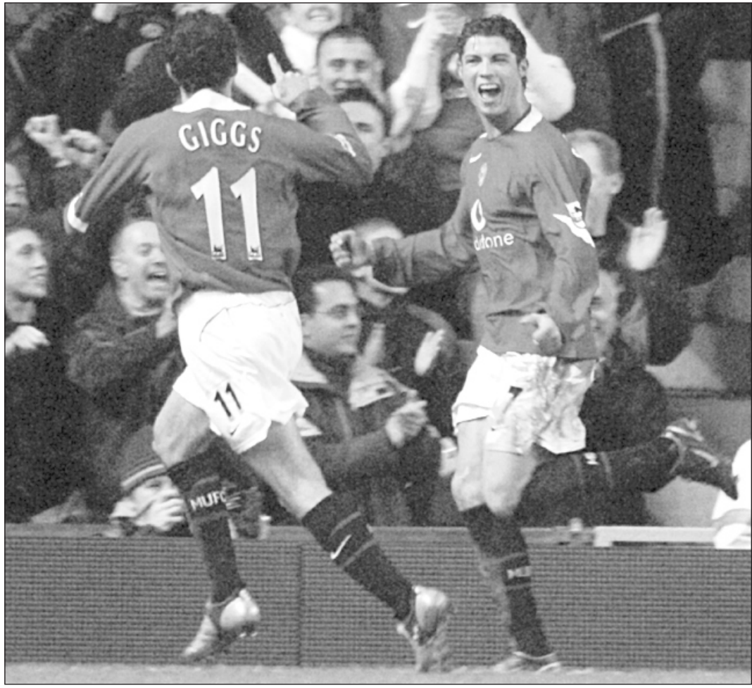
Cristiano Ronaldo (R) of Manchester United is being congratulated by teammate Ryan Giggs after the former scored one of his two goals against Bolton Wanderers at Old Trafford on Saturday.

Ivanovic then leapt to a 4-0 lead in the second set and appeared ready to claim a swift victory. But she failed to maintain her aggression and allowed her experienced opponent back into the match.