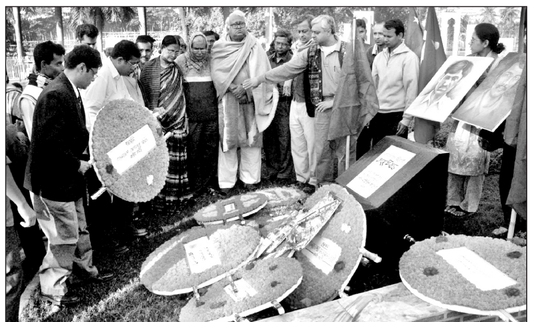
Leaders of Communist Party of Bangladesh place wreaths at the Sanghati Stambha in the city yesterday. The Stambha was set up in memory of the two Chhatra Union leaders who were killed in 1973 during an anti-imperialism demonstration in the capital.

133 journalists were attacked, 164 received death threats and 36 others were also threatened.