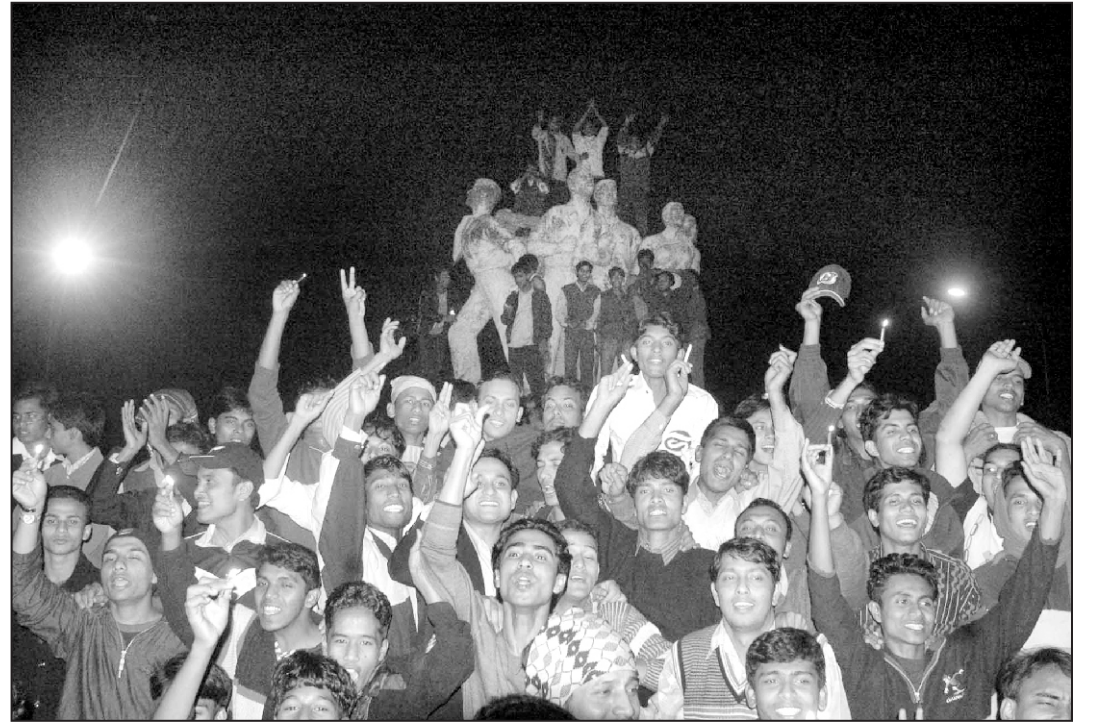
Jubilant students of Dhaka University through the Aparajeya Bangla on the campus at midnight on Saturday to welcome the New Year.