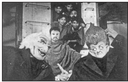
A scene from the play The Mission