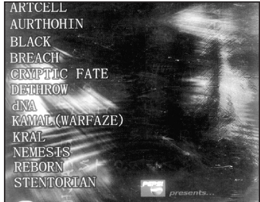
Cover jacket of the album Agontuk-2

The eighth track Shada by Breach has very catchy guitar, with simple lively lyric and exhilarating drum-