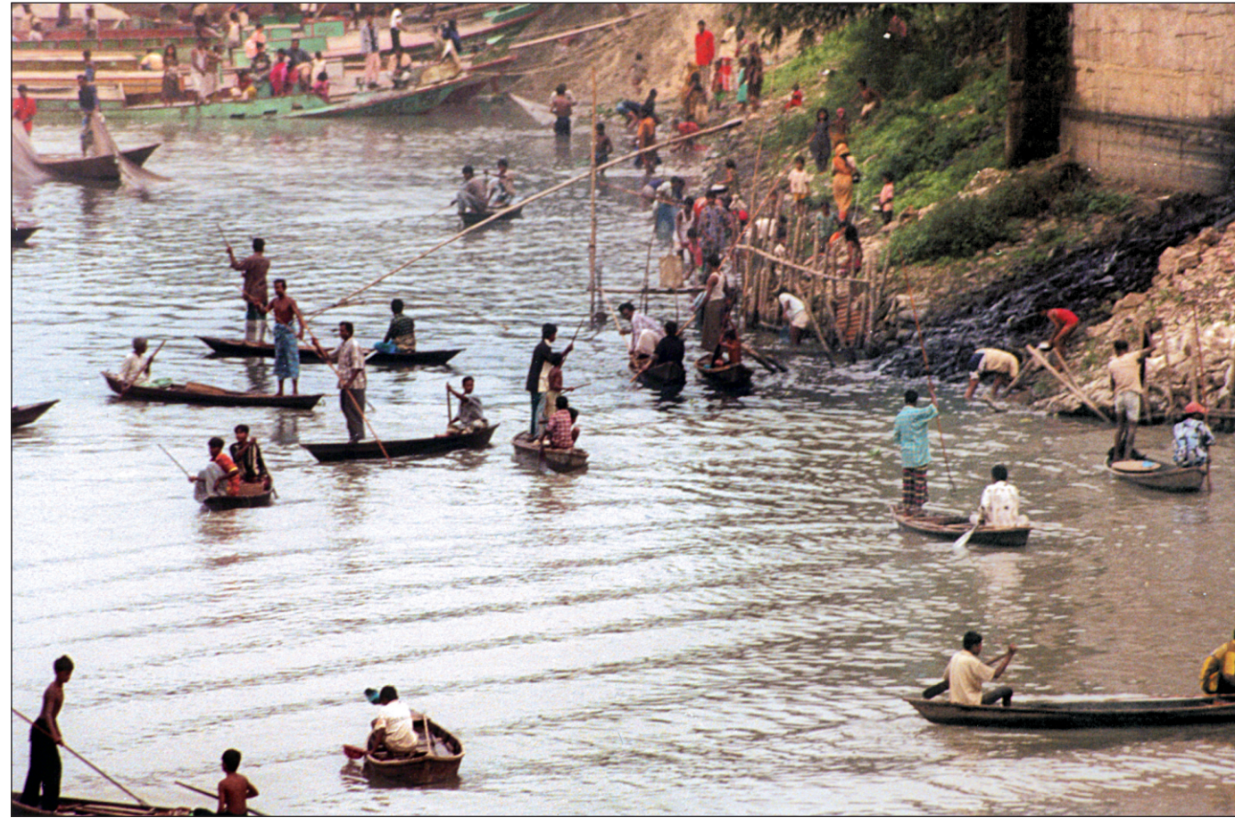
Untreated industrial waste from Tongi Industrial Area falls into the Turag river yesterday afternoon, left, as people continue fishing in the river waters turned so toxic that fish are dying out. A man shows off his catch, right, made using a spear after the near-dead fish floated to the water's surface.