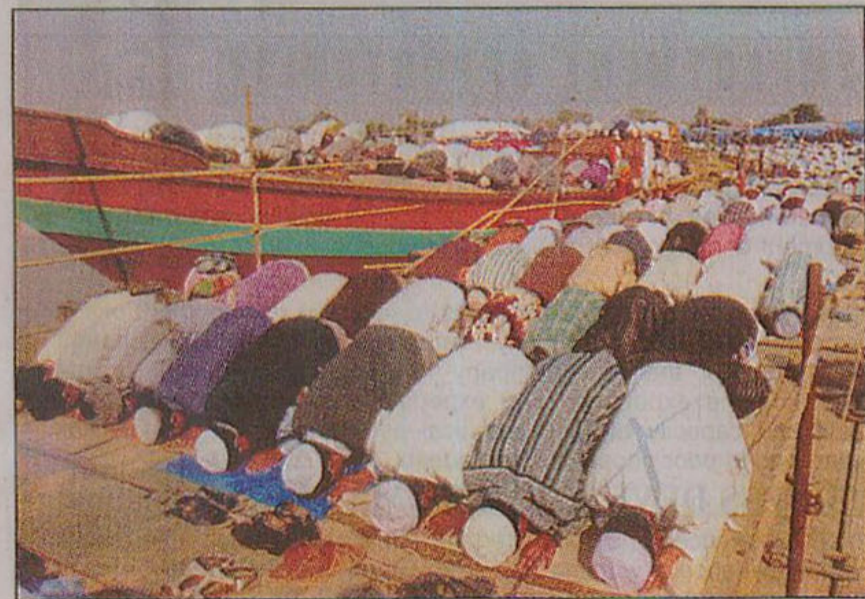
Devotees offer Friday prayers on the bank of Turag river in Tongi as thousands streamed into the venue for Biswa Ijtema, one of the largest religious congregations in the world, which begins today.

STAFF CORRESPONDENT Biswa Ijtema, a congregation of world Muslims organised by the Tabligi Jamaat, begins at Tongi about 20 kilometres north off the city today. Meanwhile, all arrangements have been made for the three-day annual gathering and hundreds of thousands of Muslim devotees from home and abroad have converged on the bank of the river Turag. The organisers yesterday were giving final touches to the huge canopy erected on 162 acres and earth filling works for holding the Biswa Ijtema, considered as the second largest gathering of Muslims on the planet.