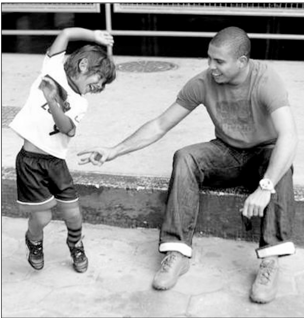
CHRISTMAS SAMBA! Brazil superstar Ronaldo is amused by the dance of a child at Maracana Stadium in Rio de Janeiro on December 24. Ronaldo, went to the stadium to watch an informal match with friends, while on holiday in Rio.

"When I speak to him, I can see there is a true ambition in him."