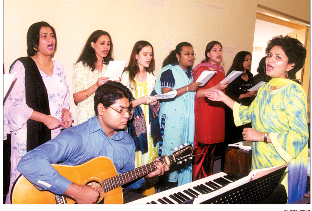
Christian youths sing carols at a church at Kakrail in the city yesterday to celebrate the Christmas Day.

A discussion on the 'Independence of Bangladesh and contemporary thoughts', organised by Jatiyatabadi Peshaiibee Parishad, will be held with Commerce Minister Amir Khasru Mahmud Chowdhury as chief guest. Venue: National Press Club. Time: