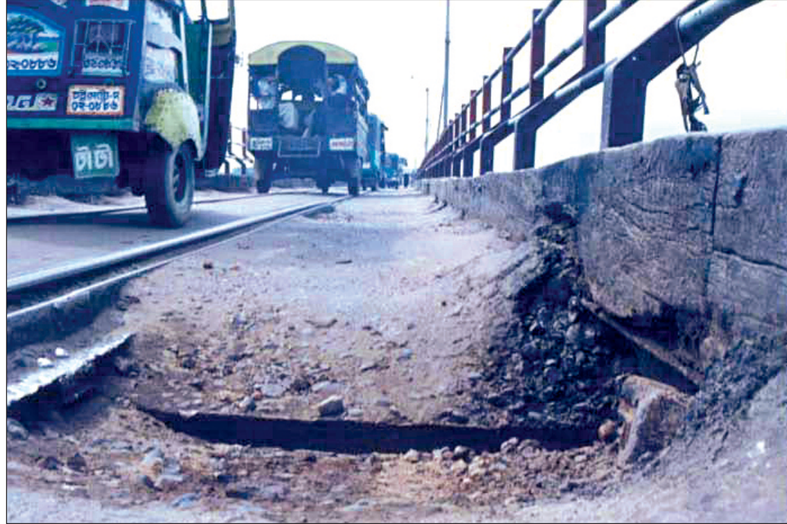
Kalurghat Bridge (Left) has developed several big cracks with huge holes over the years. And despite having rail bits on the entry points of Shah Amanat Bridge (Right) to bar heavy vehicles, they find no difficulty by giving their bodies special shape to cross the bridge risking the lives of passengers.