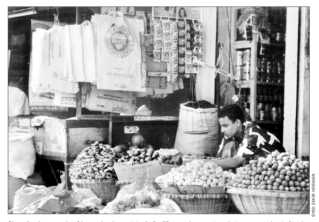
Shopping bags made of banned nylon net, toxic fertiliser and cement packets are on sale at city shops

'Discussions on the issue are on and once the government gives a go-ahead we will take necessary steps without any delay', said a garment factory