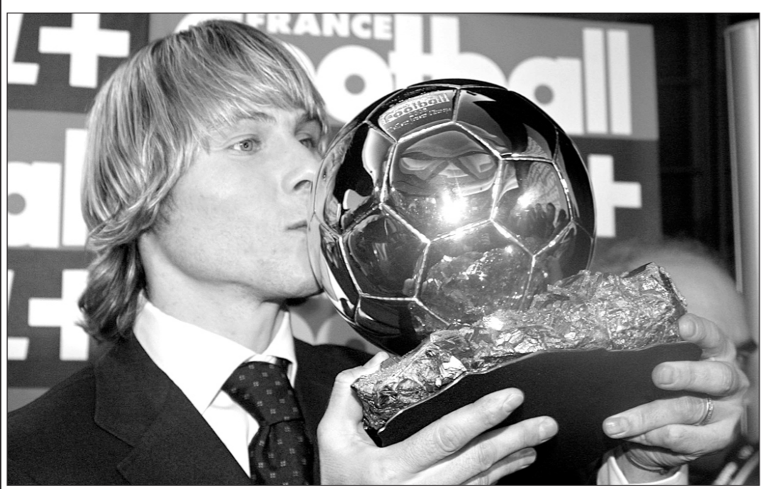
TASTES SO SWEET: Juventus' Czech Republic superstar Pavel Nedved kisses the Ballon d'Or trophy handed out by France Football magazine for the 2003 European Footballer of the Year on December 23 in