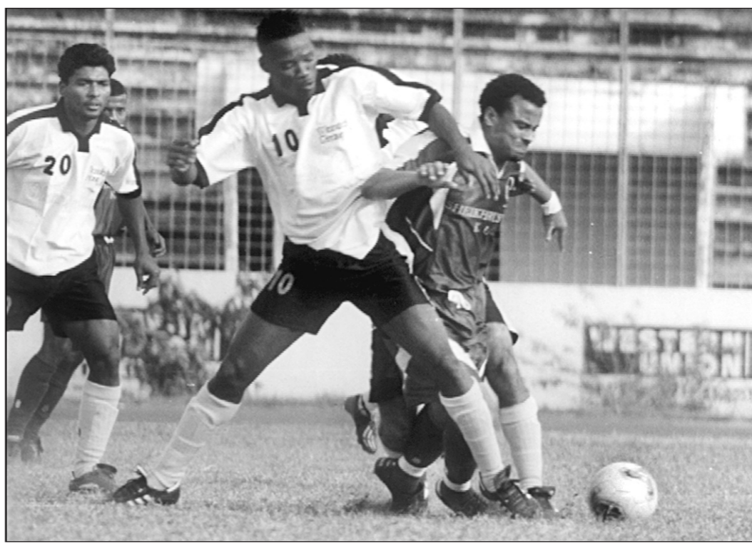
Action from yesterday's Western Union Premier Division Football League clash between Dhanmondi Club and Sheikh Russell Krira Chakra at the Sher-e-Bangla National Stadium in Mirpur.