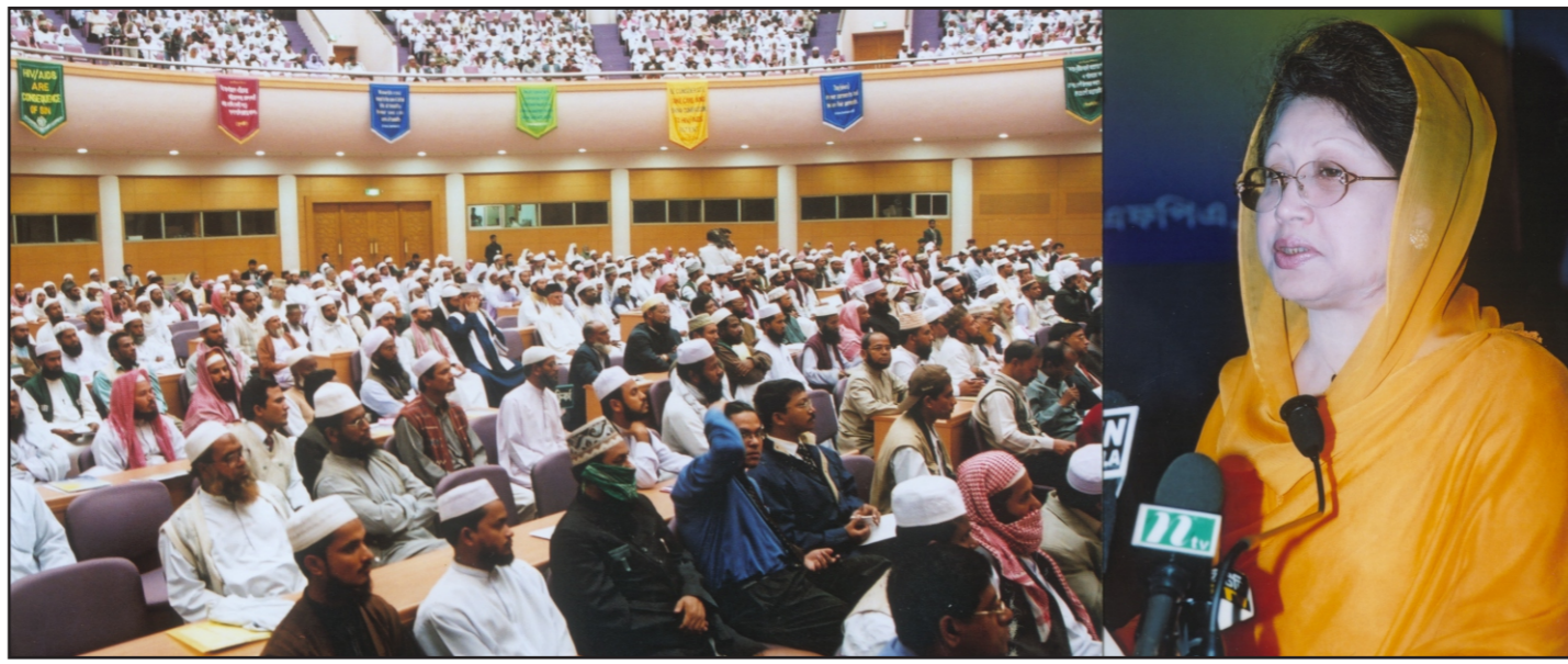
Prime Minister Khaleda Zia speaks at the inaugural ceremony of National Imam Conference 2003 at the Bangladesh-China Friendship Conference Centre in the city yesterday.

Students of all departments of the BUET batch '90 have been requested to contact the following persons for registration: Khasatagi (0171-026436), Biplob (019-350257), Rakshit (0171-591541) and Parvez (0171-544592).