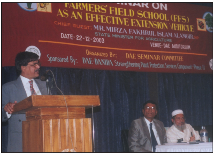
State Minister for Agriculture Mirza Fakhrul Islam Alamgir speaks at a seminar on 'Farmers' Field School as an effective extension vehicle' in the city on Monday. Department of Agricultural Extension in association with the DANIDA organised the event.

She is survived by one son and four daughters.