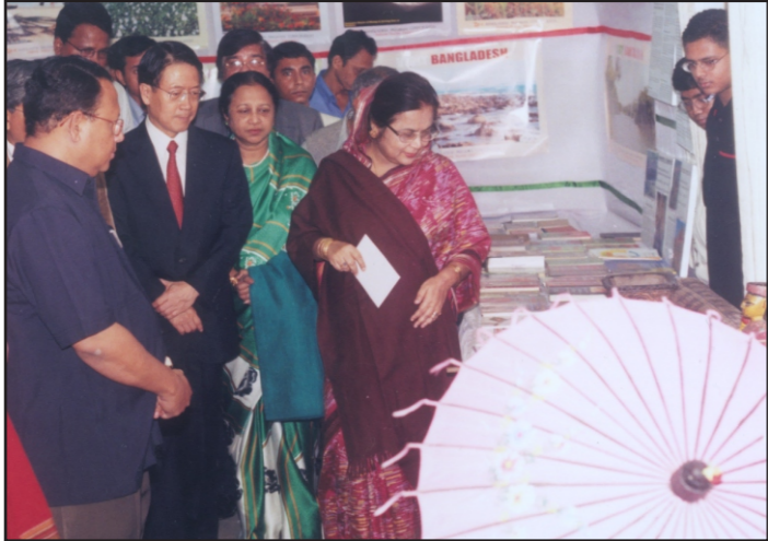
An exhibition titled 'Beautiful Bangladesh' concluded on the Public Library premises in the city yesterday. The National Association of Unesco Clubs in Bangladesh organised the event.