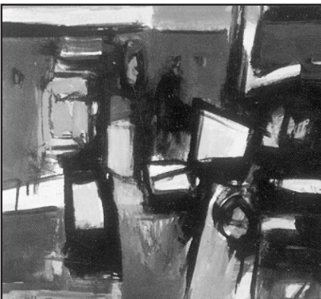
Bengal Symphony Acrylic on paper

Although different in approach, the three artist showed a common base of being eager to experiment with "form, colour and space".