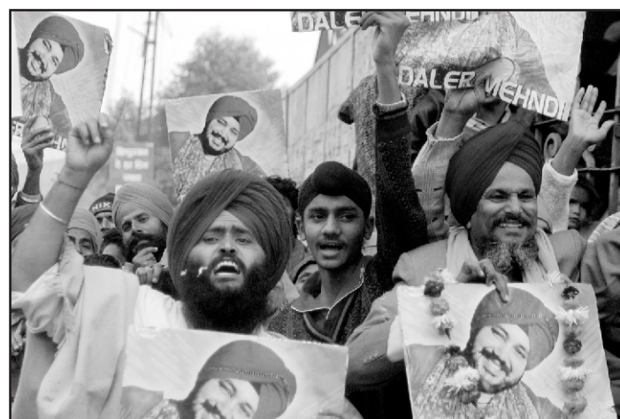
Fans of Indian singer Daler Mehndi shout slogans and wave pictures of Mehndi in front of the Tis Hazari Court in New Delhi, December 20, as they protest against his arrest.