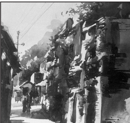
Panam Nagour Water Color

with texture as in many of his paintings in the exhibition.