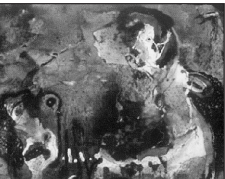
Illusive Image Mixed Media