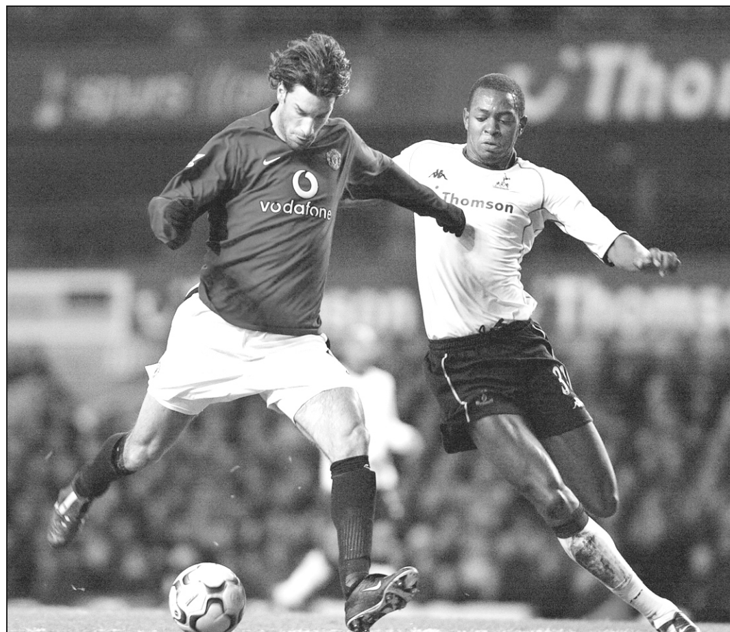
Manchester United's Dutch international Ruud van Nistelrooy prepares to shoot during the Premiership match against Spurs on Sunday.