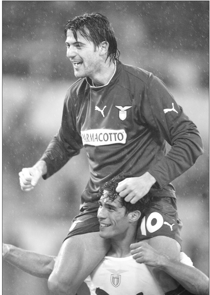
Lazio forward Dejan Stankovic (above) and Bernardo Corradi celebrate after beating Inter Milan 2-1 at Olympic stadium in Rome on December 21