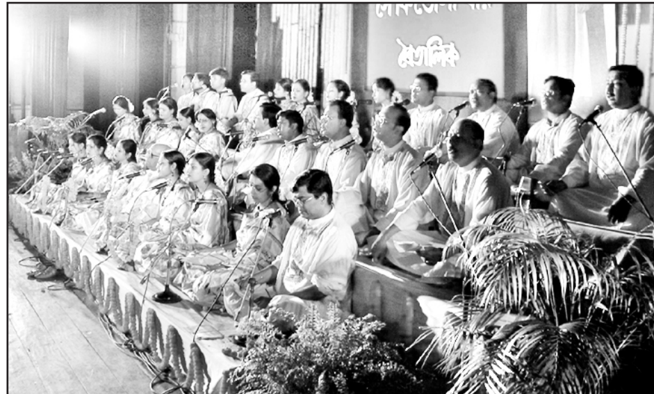
Boitalik Rabindra Sangeet Angaan held a musical programme Shey Ki Bhola Jai

The stage setting with garlands, backdrop of Tagore's portrait, with decorative potted plants bordering the platform along with the centre-