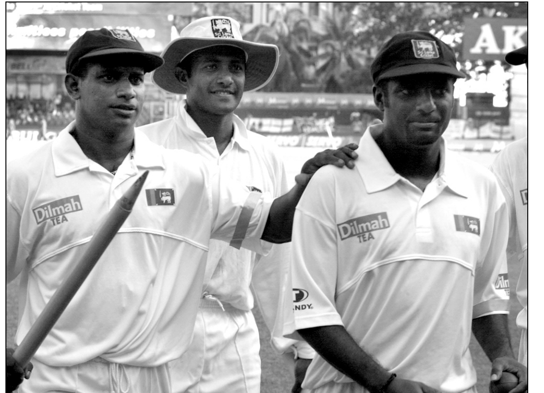
THE MAGICIAN: Sri Lanka spin wizard Muttiah Muralitharan (R) leads captain Hashan Tillakaratne (C) and Sanath Jayasuriya off the field after their team defeated England in the third and final Test in Colombo yesterday.