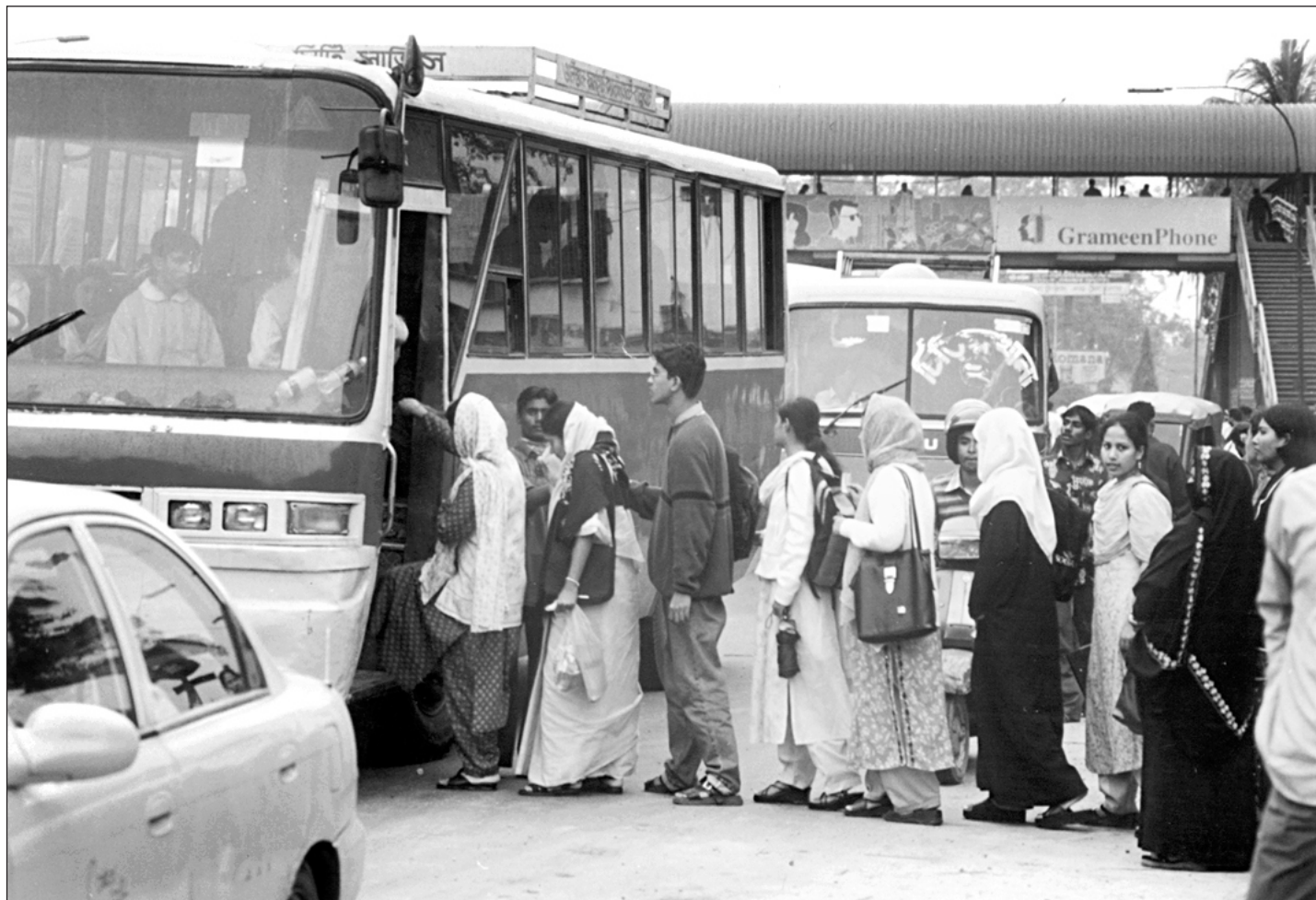
The queue of commuters for public transport is getting longer every day.

After the withdrawal of the lease, only seven buses were operating on the route via Rampura. The BRTC added 11 more buses from December 7. These were however, buses lying idle with mechanical problems but were fixed in a hurry to hit the road.