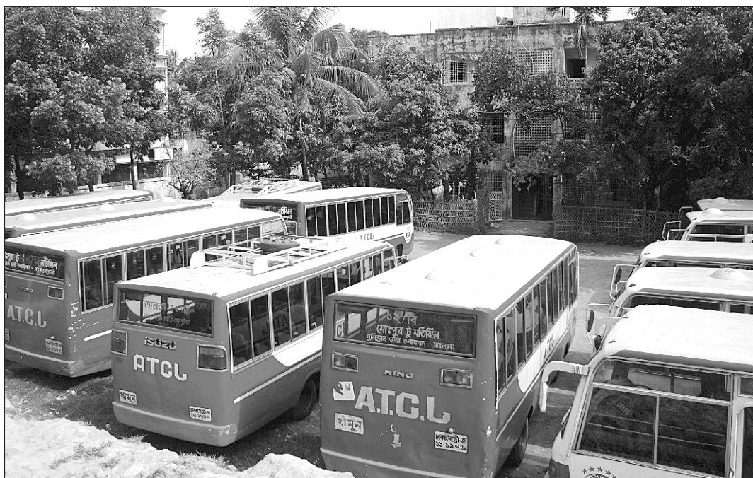
File photo of buses illegally parked inside Asad Gate Colony.

"We will file a GD soon as the ATCL has not paid attention to our request of moving away. As they have resumed parking without any legal ground, we will definitely take action against the owners," Bhuiyan added.