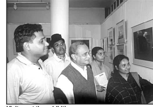
Visitors at the exhibition

Photography exhibition on aircraft and aviation is first of its kind in Bangladesh. The exhibits include 51 photographs of aircraft, aerial views of Bangladesh and airplane-human juxtaposition.d citizens. The exhibition will remain open till 23 December from 10 AM to 7