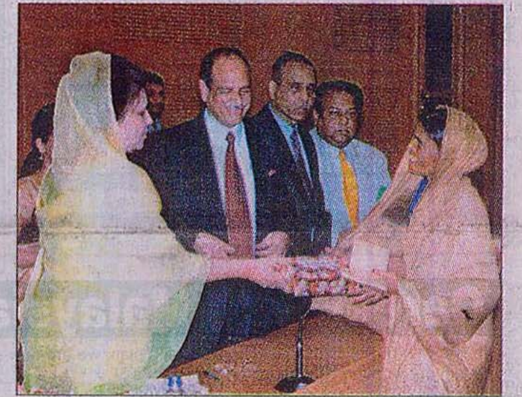
Prime Minister Khaleda Zia yesterday presents freedom fighter Bir Pratik Taramon Bibi a gift at a reception accorded to freedom fighters by the Ministry of Liberation War Affairs marking Victory Day at the Bangladesh China Friendship Conference Centre in the city.