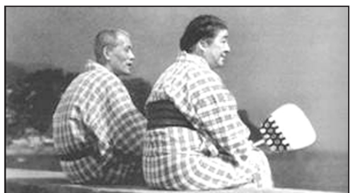
A still from the film Toky Monogatari (Tokyo Story, 1953)

Many contemporary filmmakers admire and often incorporate his methods in their films. The list includes such stalwarts in the contemporary world cinema like Wim Wenders (Germany), Jim Jarmusch (USA), Hou Hsiao-Hsien