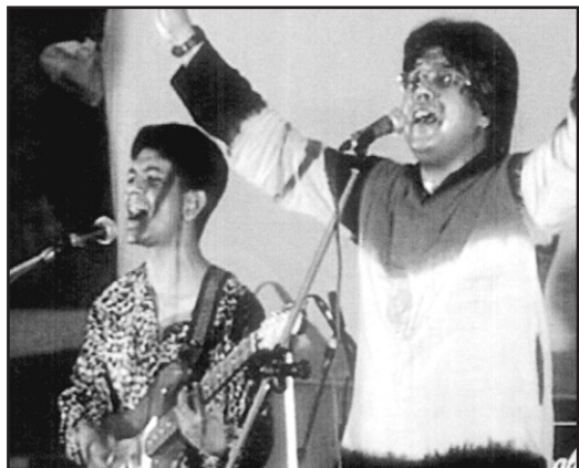
Maksud O Dhaka performed their songs on Bangladesh

When Souls, one of the popular bands in Bangladesh, took to the stage first, the venue was already filled up with an enormous audience for the majestic celebration. Then came Dalchhut and performed five or six of their popular numbers like Gari cholena,