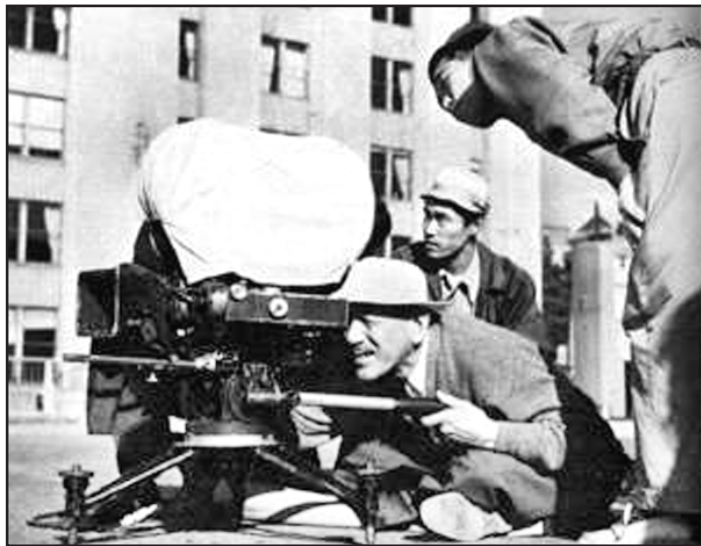
Filmmaker Yasujiro Ozu (1903-1963) looking through the camera (in 1952)

A KIRA Kurosawa is known all over the world as the 'trade-mark' Japanese filmmaker, and wherever Japanese cinema is mentioned, Kurosawa's name comes first as he is the most popular and accessible of all the Japanese filmmakers abroad. But, Yasujiro Ozu is the filmmaker whose films represent the essential 'Japaneseness'.