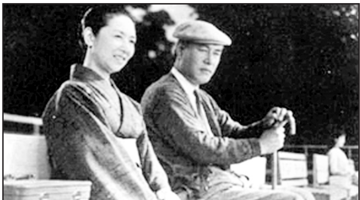
A still from the film Higan-Bana (Equinox Flower, 1958)

His camera hardly moves and for indoor setting, it is always placed in the same position: at about two feet above the floor level, the viewpoint of the Japanese