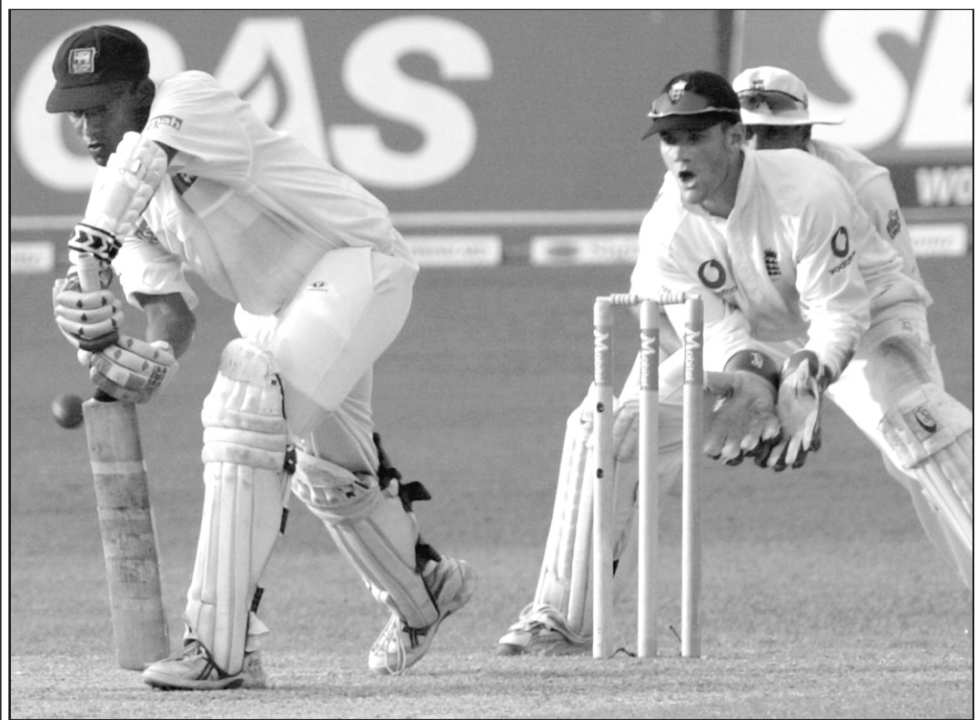
Sri Lankan batsman Thilan Samaraweera plays forward defensive as England wicketkeeper Chris Read looks on day two of the Colombo Test yesterday.