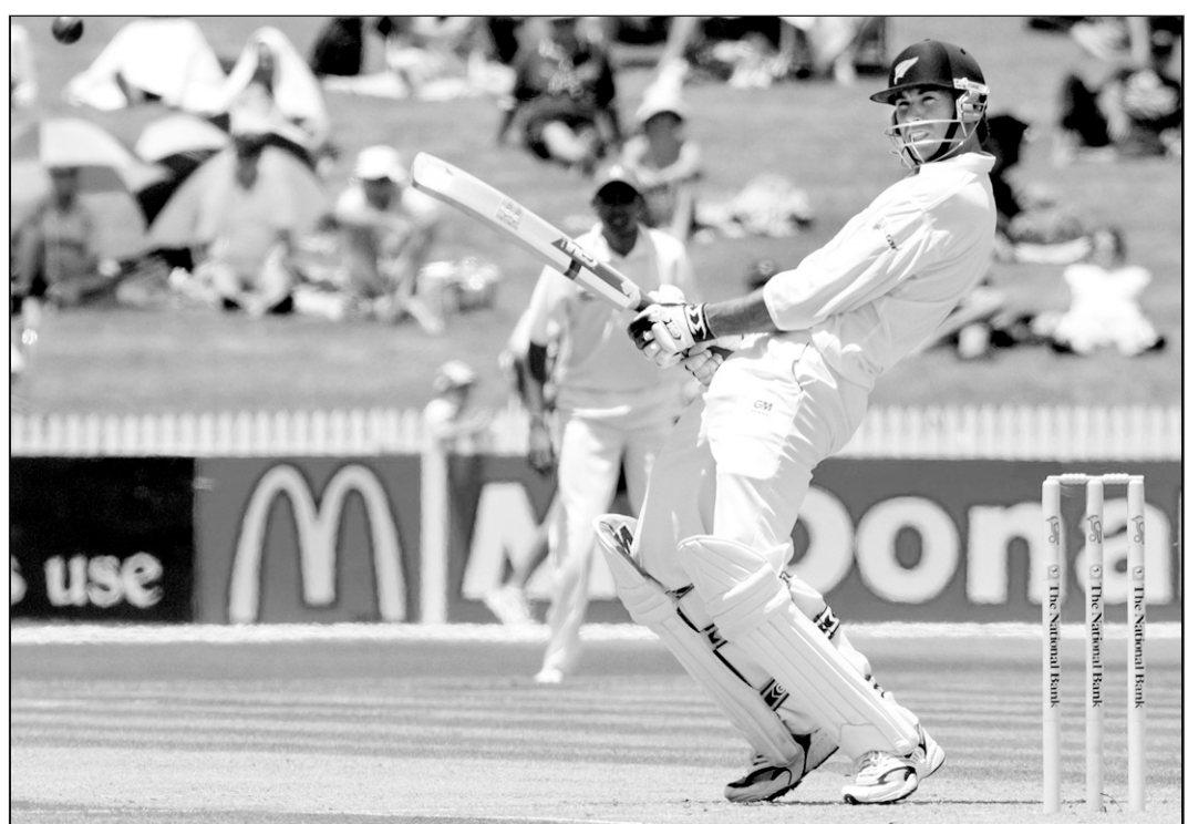
New Zealand cricket captain Stephen Fleming cuts close to his body during his unbeaten 125 on the opening day of the first Test against Pakistan at WestPac Trust Park in Hamilton yesterday.