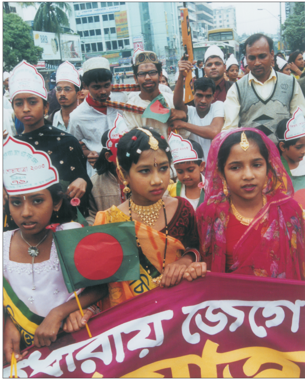
The Chirantan, an organisation of the children and juveniles, took out a colourful procession in Dhaka yesterday to mark the Victory Day.