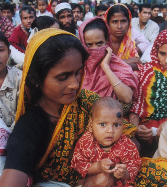
The Victory Day Observance Committee of the Deprived and Poor staged a rally at the Central Shaheed Minar yesterday demanding steps for regular employment for them.

A networking seminar on 'Development and Mass media', organised by Mass-Line Media Centre, will be held. Venue: CIRDAP auditorium. Time: 11.00am.